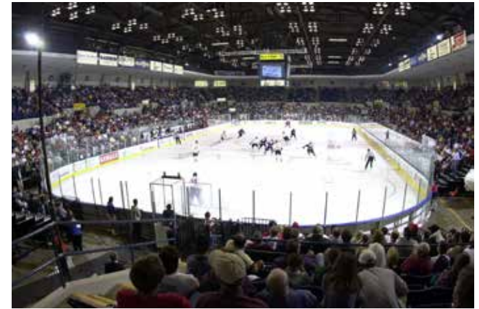
Saginaw Spirit at the Dow Event Center

The Old Town/West Side City area houses many popular clubs, locally owned restaurants and arts organizations. The city's roster of local arts organizations includes Pit and Balcony, one of the oldest continuously operating community theaters in the United States, founded in 1932.