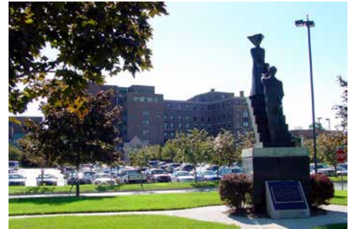
St. Mary's of Michigan

Synergy Medical Education Alliance ( www.synergymedical.org ) is part of a progressive move forward in medicine. Synergy Medical offers five community-based, fully accredited residency training programs in emergency medicine, family practice, internal medicine, general surgery and obstetrics and gynecology. Synergy's formal affiliation with Michigan State University College of Human Medicine means that its residents and faculty benefit from daily interaction with third- and fourth-year medical students who are completing their clinical training. Its residents rotate among Synergy member hospitals, which have a combined bed capacity of nearly 1,000, and feature state-of-the-art facilities.