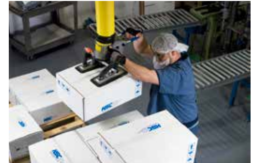
Hemlock Semiconductor Corp.