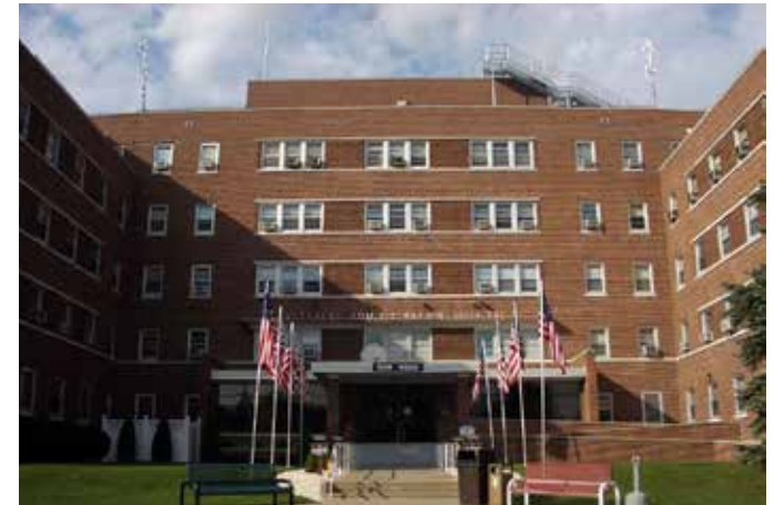
Aleda E. Lutz VA Medical Center

Mobile Medical Response, Inc. ( www.mobilemedical.org ) provides emergency services in eight Mid-Michigan counties including Saginaw, Bay, Gratiot and Tuscola. MMR's Medical Communications Center dispatches ambulance service in eight counties, as well as dispatching FlightCare from St. Mary's and LifeNet of Michigan from Covenant HealthCare in Saginaw.