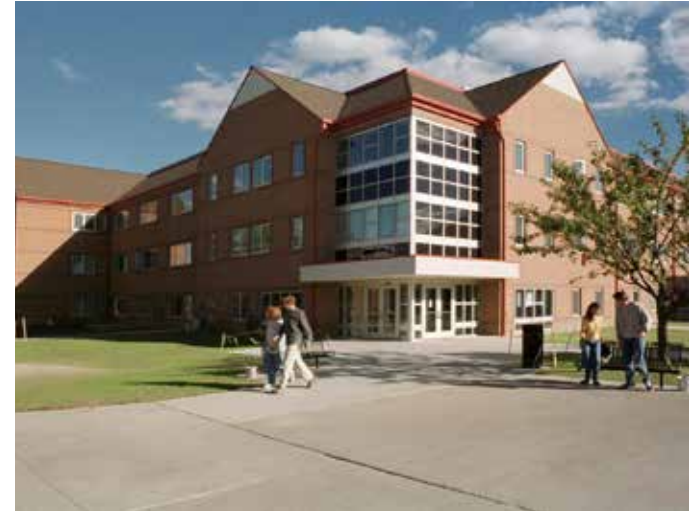
Saginaw Valley State University

The City of Saginaw is served by the Saginaw Public School District ( www.spsd.net ). The district operates 10 elementary schools, one middle school and three high schools. Michigan Lutheran Seminary ( www.mlsem.org ) is the lone private high school in the city. Charter schools in the city are North Saginaw Charter Academy, Saginaw Prep schools and the International Academy of Saginaw ( www.ias-sabis.net ).