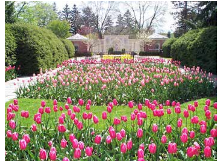
The Kingwood Center Tulip Garden

Recreational opportunities are plentiful both in Richland County and in neighboring counties, whether on land or on water.