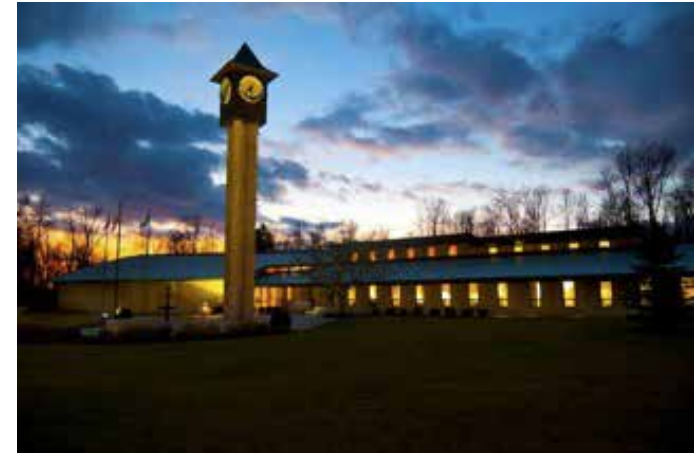
Ontario Municipal Building