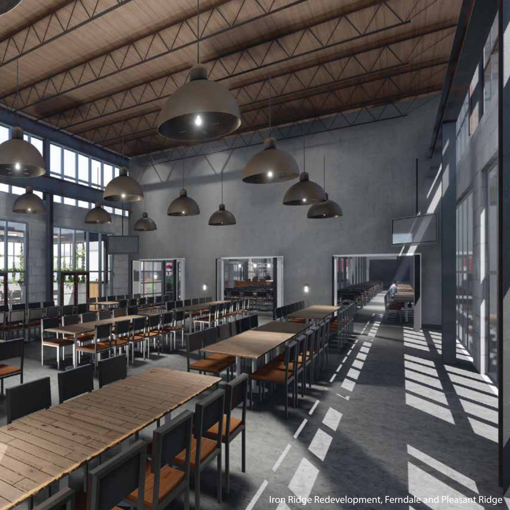
Iron Ridge Redevelopment, Ferndale and Pleasant Ridge