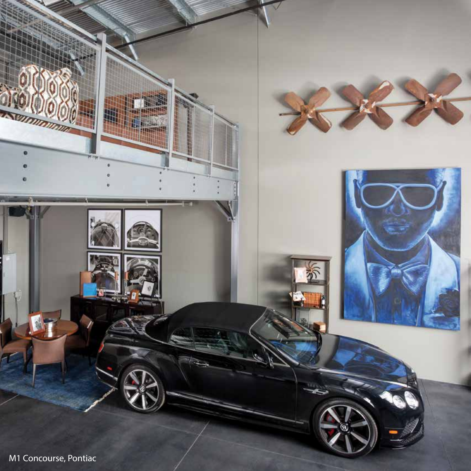
M1 Concourse, Pontiac