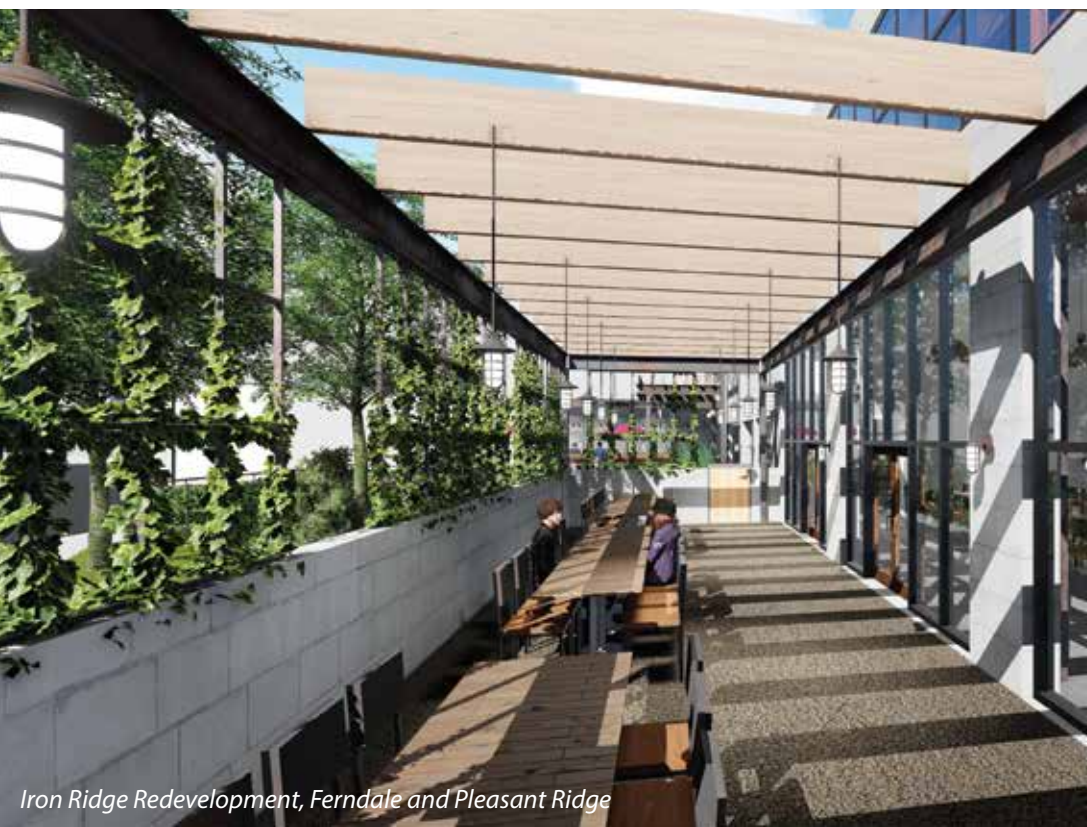
Iron Ridge Redevelopment, Ferndale and Pleasant Ridge

More than 300 acres of contaminated property cleaned and repurposed for productive use