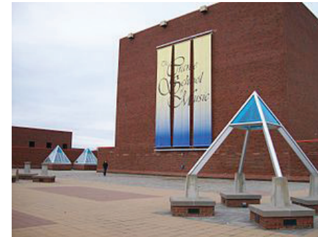
Crane School of Music, SUNY Potsdam