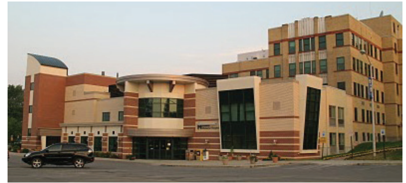
Massena Memorial Hospital

Massena Memorial Hospital, located at One Hospital Drive in Massena, provides high-quality healthcare, administered by a team of professionals in a caring, compassionate, efficient and ethical manner that promotes the health and well-being of the local community. From the quality and cleanliness of a patient's room and the consistency of meals served to the level of medical care received, the professionals at Massena Memorial Hospital pride themselves in delivering inpatient services in a highly personalized manner that considers the specific needs of each patient. Massena Memorial Hospital also is affiliated with Fletcher Allen Health Care, a teaching facility in Burlington, Vt., and Upstate University Hospital in Syracuse, NY.