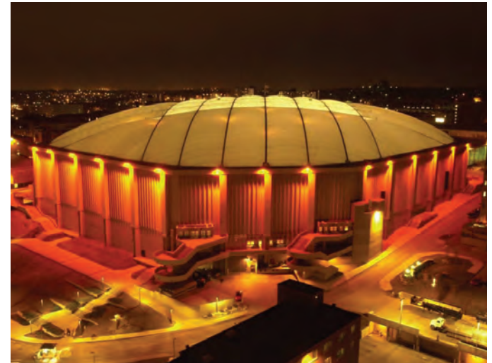
The Carrier Dome

The area boasts a variety of cultural organizations (many nationally recognized) and their activities are a hallmark of the community. These include the Syracuse Stage, the Famous Artist Series, and the Syracuse Opera Company. The Everson Museum is downtown, as is Syracuse University's Lowe Art Center. Other venues for the arts and entertainment include the Landmark Theatre, the OnCenter Complex, and the Empire Expo Center at the New York State Fairgrounds, site of the annual New York State Fair.