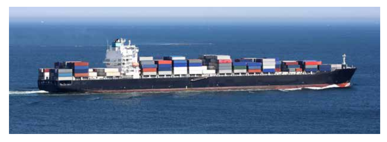
*Information obtained from RACER research.

Lordstown also is conveniently located a one-hour drive from the Port of Cleveland (www.portofcleveland.com), operated by the Cleveland-Cuyahoga County Port Authority. As the largest port in Ohio, the Port of Cleveland has extensive logistical