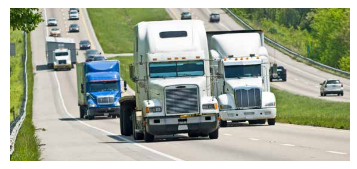
*Information obtained from RACER research.

Lordstown Township, which nearly completely incorporated as the village of Lordstown in 1976, was one of the original survey townships of the Connecticut Western Reserve. The township, and subsequently the village, was named for Samuel P. Lord, who laid out the township. According to the 2000 census, the population was 3,417, and the village has a total area of 23.1 square miles. It is estimated that the current population of Lordstown is just over 3,000.