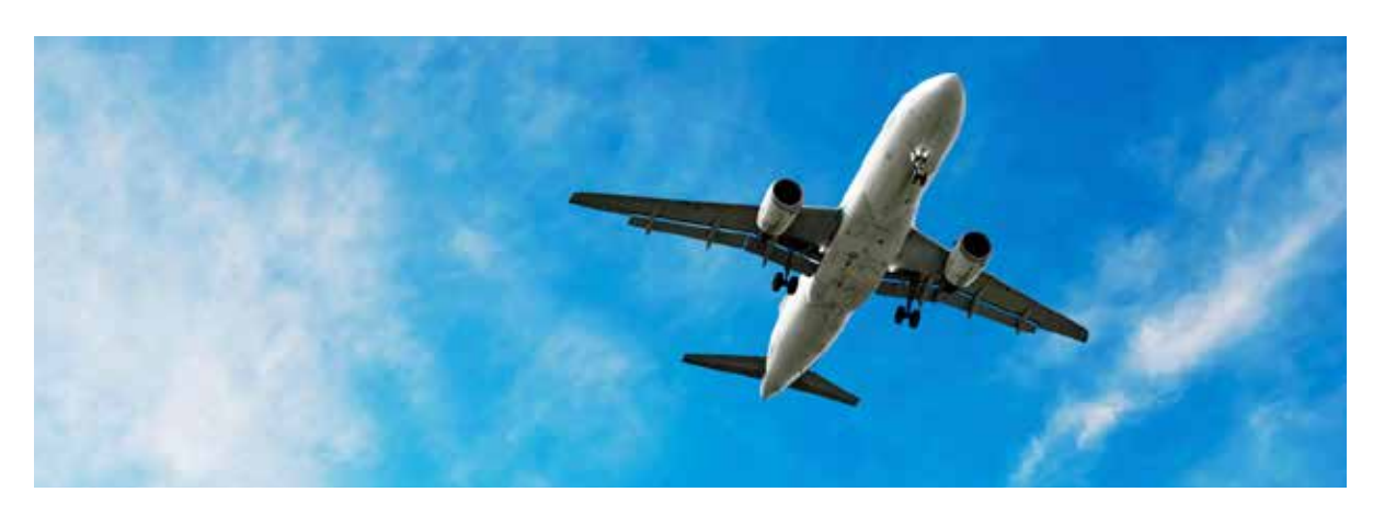
*Information obtained from RACER research.

In addition, Michigan Flyer offers eight daily round-trips to Detroit Metro Airport, one of the world's largest air transportation hubs, approximately two hours from East Lansing.