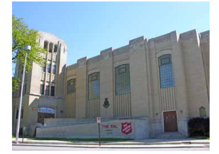
The "Sal" (Salvation Army) Community Center

Oakland County is committed to the planning, design and maintenance of a highquality infrastructure (telecommunications, broadband, roads, sewer, water, gas and electricity) to support development in the community.