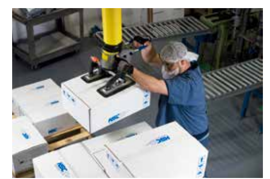
Hemlock Semiconductor Corp.