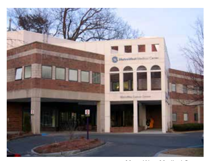
MetroWest Medical Center

MWMC strives to be the health care provider of choice for the region by placing the patient at the center of all decision making, offering exceptional service to patients, comprehensive and high-quality clinical programs, a supportive work environment for employees and an outstanding medical staff that represents a full range of specialties distinguished for clinical excellence.