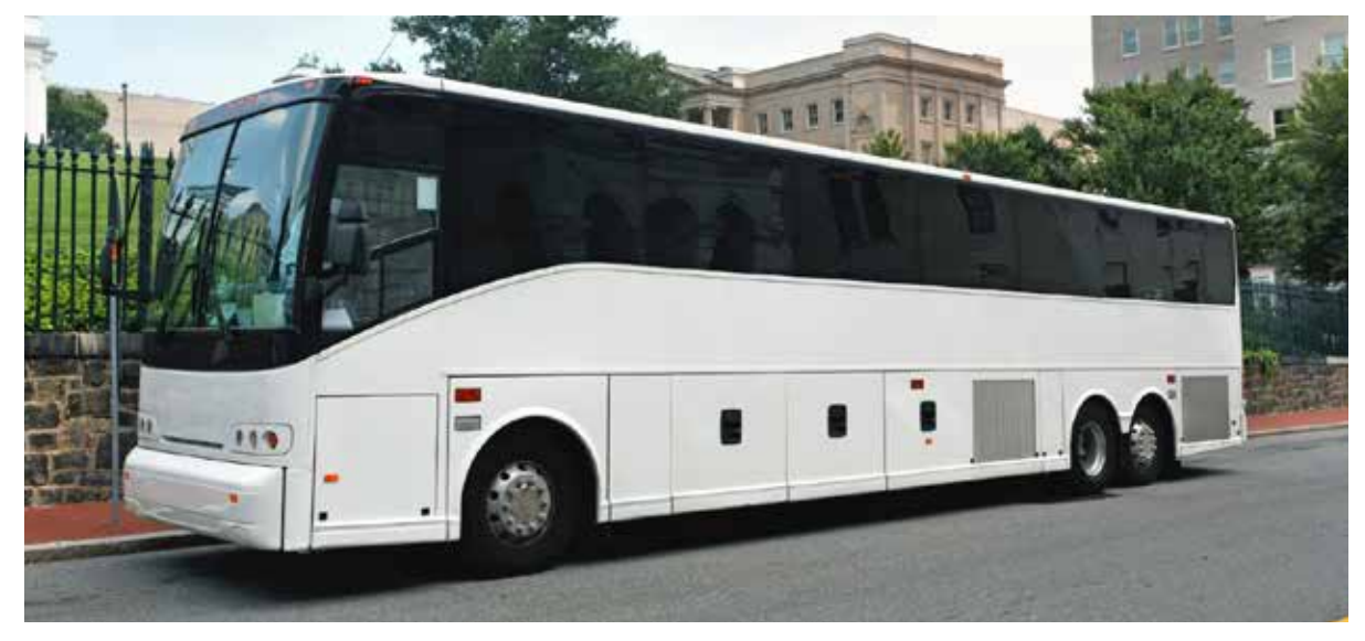
*Information obtained from RACER research.

The MetroWest system, which has its hub in downtown Framingham, reaches throughout Framingham and into the surrounding communities of Ashland, Holliston, Hopkinton, Marlborough, Natick, Sherborn, Southborough, Sudbury, Wayland and Weston.