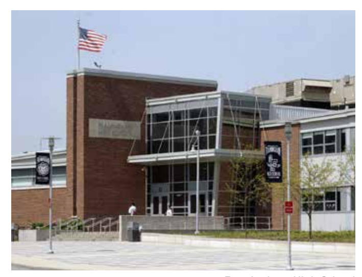
Framingham High School

The Framingham Public School System is committed to the most complete development of each student. Educational programs are designed to provide all students with the knowledge and skills necessary for leading a worthwhile life in a free multi-cultural society. The curriculum is supported through professional development and discipline-specific leadership provided by the curriculum resource department and the department chairs.