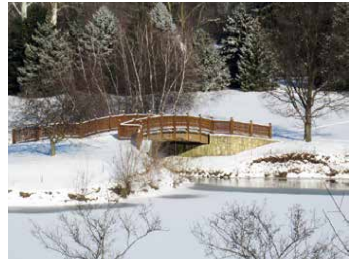
Toledo Botanical Garden

Racing fans can watch cars at the Toledo Speedway or horses at Raceway Park, which hosts a summer harness racing meet.