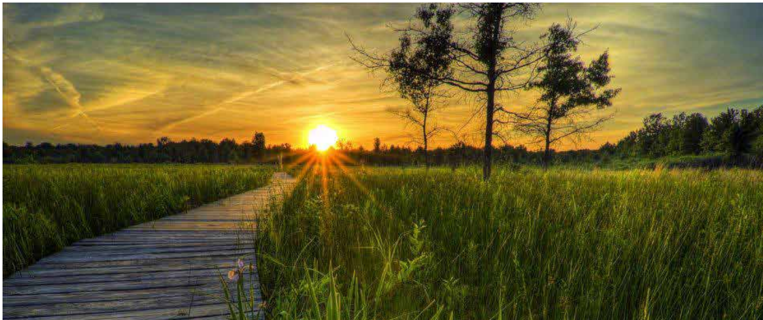
Irwin Prairie State Nature Preserve

The Toledo Symphony Orchestra, which has toured worldwide, is housed in the East Wing of the art museum. The Stranahan Theater is a major concert hall located on the city's south side. The Toledo Opera, in existence since 1959, is housed in the historic Valentine Theatre Downtown. The Toledo Repertoire Theatre was created in 1933 and performs both Broadway hits and lesser-known original works.