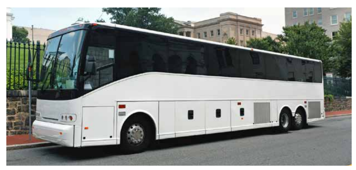
*Information obtained from RACER research.

Burton residents may also make use of public transport options through MTA's Your Ride service. Residents simply go to the local Burton Your Ride Service Center for transportation options into and out of nearby Flint for greater shopping and convenience opportunities.