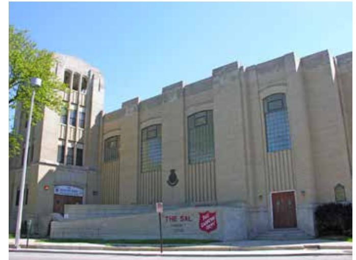
The "Sal" (Salvation Army) Community Center