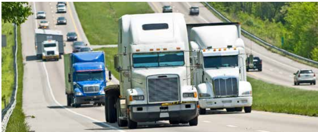
*Information obtained from RACER research.

The Miami Valley Region, of which Moraine is a part, is well-positioned for global competition, with a major airport, major highways, and a population mass within close proximity.