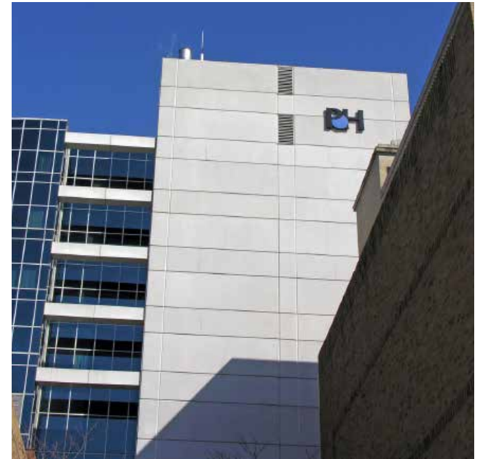
McLaren-Oakland Medical Center

Crittenton has partnerships with the University of Michigan Health System for cardiac surgery and with Barbara Ann Karmanos Cancer Center for cancer care.