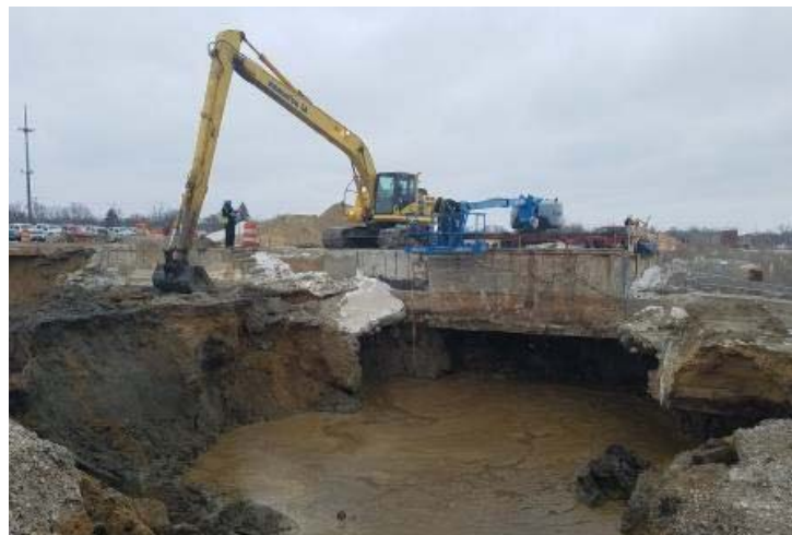
Recently completed PCB soil excavation work at Buick City

Buick City contains soil and groundwater (water below the surface) that is contaminated with various petroleum products and chemicals that were used as part of GM's manufacturing activities. Some of the petroleum products float on top of the groundwater and are very difficult to remove. Select areas of the Buick City property also have contamination levels in soil that require cleanup. The goal of the Buick City environmental work is to meet EPA and MDEQ cleanup standards and support redevelopment of the site.