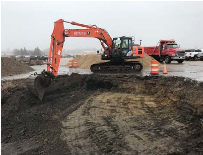
Recently completed PCB soil excavation work at Buick City