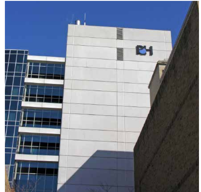
McLaren-Oakland Medical Center

Crittenton has partnerships with the University of Michigan Health System for cardiac surgery and with Barbara Ann Karmanos Cancer Center for cancer care.