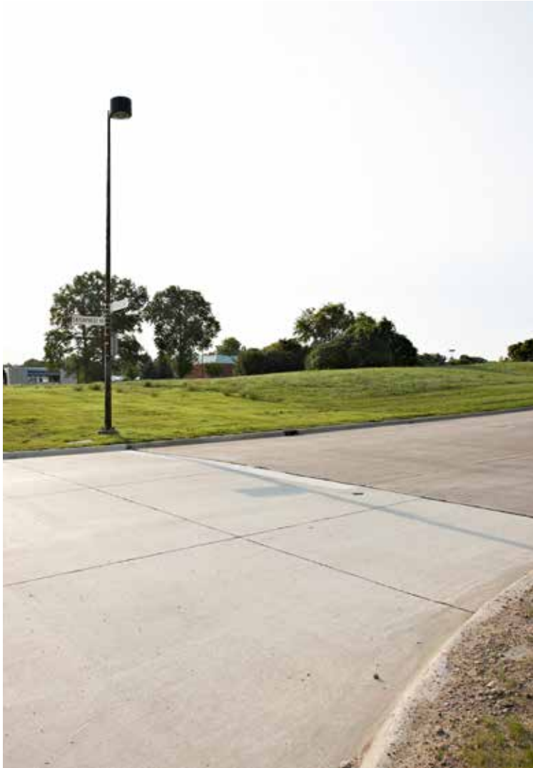
Parcel 3 & 4