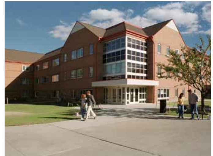
Saginaw Valley State University

The City of Saginaw is served by the Saginaw Public School District ( www.spsd.net ). The district operates 10 elementary schools, one middle school and three high schools. Michigan Lutheran Seminary ( www.mlsem.org ) is the lone private high school in the city. Charter schools in the city are North Saginaw Charter Academy, Saginaw Prep schools and the International Academy of Saginaw ( www.ias-sabis.net ).