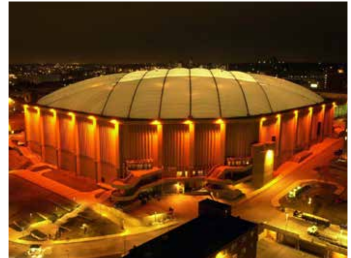
The Carrier Dome

The area boasts a variety of cultural organizations (many nationally recognized) and their activities are a hallmark of the community. These include the Syracuse Stage, the Famous Artist Series, and the Syracuse Opera Company. The Everson Museum is downtown, as is Syracuse University's Lowe Art Center. Other venues for the arts and entertainment include the Landmark Theatre, the OnCenter Complex, and the Empire Expo Center at the New York State Fairgrounds, site of the annual New York State Fair.