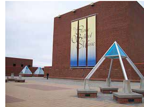
Crane School of Music, SUNY Potsdam