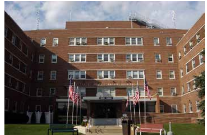
Aleda E. Lutz VA Medical Center

Mobile Medical Response, Inc. ( www.mobilemedical.org ) provides emergency services in eight Mid-Michigan counties including Saginaw, Bay, Gratiot and Tuscola. MMR's Medical Communications Center dispatches ambulance service in eight counties, as well as dispatching FlightCare from St. Mary's and LifeNet of Michigan from Covenant HealthCare in Saginaw.