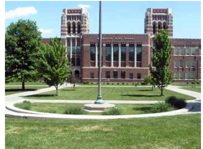
Wyandotte High School

Home of KU's Schools of Medicine, Nursing and Allied Health.