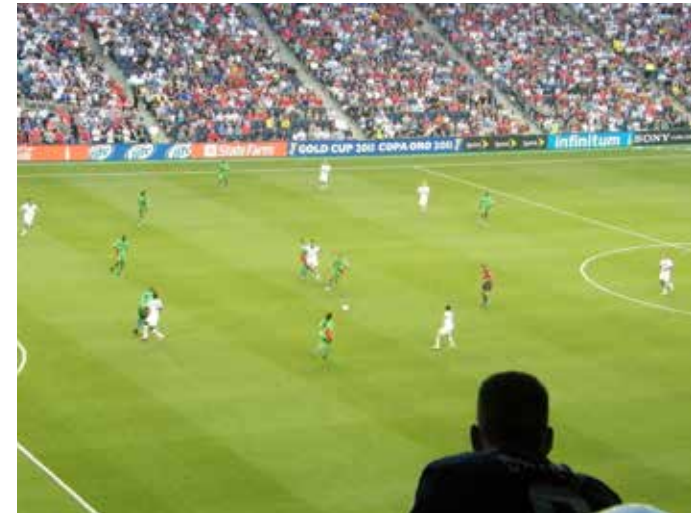
Sporting Kansas City of MLS

Kansas City, Bonner Springs and Edwardsville are the primary communities of Wyandotte County, which is located at the confluence of the Kansas and Missouri rivers in easternmost Kansas. In addition to The Legends at Village West, which features national retailers, unique restaurants and destination hotels, the county is the location of the Kansas International Speedway and the University of Kansas Hospital, a leader in cardiovascular, neurological and cancer research and treatment.