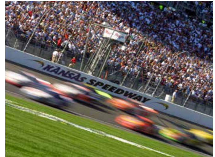
Kansas International Speedway

Longstanding attractions include the Verizon Wireless Amphitheater, featuring live concerts by America's most popular performers, and the Renaissance Festival held in Bonner Springs each fall.