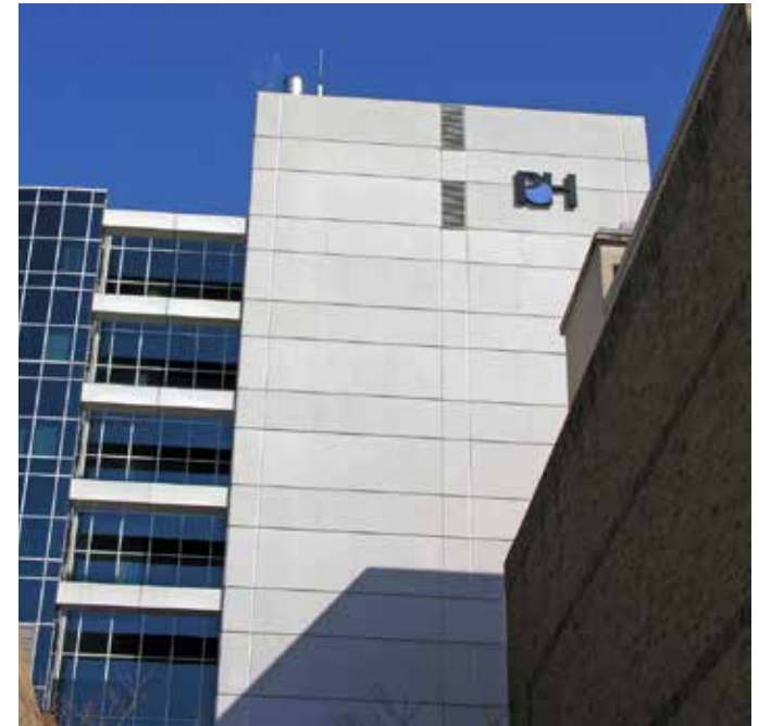
McLaren-Oakland Medical Center

Crittenton has partnerships with the University of Michigan Health System for cardiac surgery and with Barbara Ann Karmanos Cancer Center for cancer care.